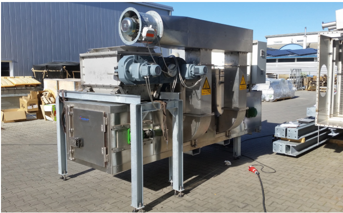
Wet material feed hopper and the roller press above the feed module, exhaust air ducts and exhaust air fan on the right

The pilot-scale belt dryer provides a water evaporation capacity of up to 50 kg/h . The pilot dryer enables the operator to dry a representative quantity (e.g. 70 kg/h) of wet material in order to check the drying parameters of this specific material. Depending on the belt speed, partial or full drying is realized with one dryer belt.