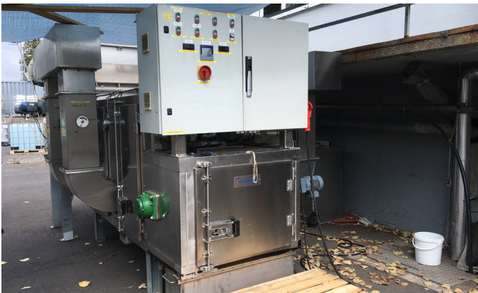
Discharge module with mobile collecting tray and control cabinet above

The dewatered, wet material is dried in two modules with electrically heated ambient air at temperatures of up to 140 °C . Both modules are equipped with recirculation fans with a capacity of 3,000 Nm 3 /h. The air circulating through the product layer takes up the amount of water to be evaporated. The water-laden exhaust air is removed from the system by the exhaust air fan. The exhaust air fan is designed for 2,000 Nm 3 /h.