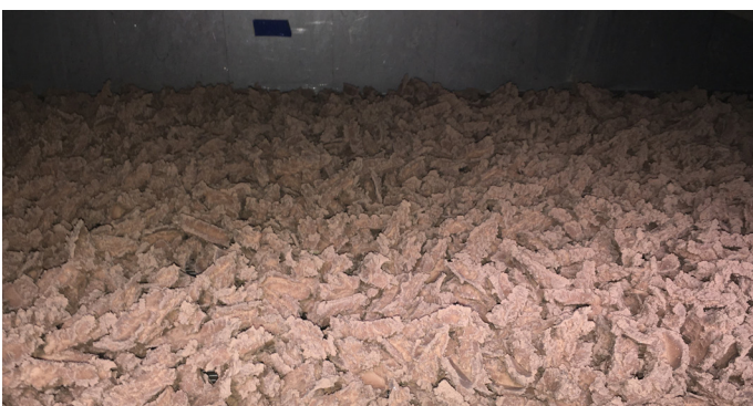
View into the second dryer module with granulated dry material

As an option, the humid exhaust air can be directed via a vertical spray condenser. The evaporated water is condensed and the condensate is cleaned in a WWTP.