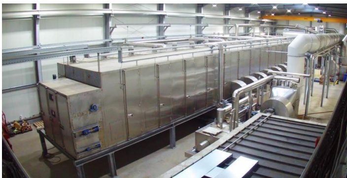
View from the end of Belt Dryer BD 3000/16 with Return module and Exhaust air fan

In the Zorbau waste incineration plant, downstream of the turbine, a part of the steam volume is used for drying digested or stabilized, dewatered sewage sludge resulting from the treatment of municipal wastewater. In 2017, a fully automated sewage sludge drying plant (KTA) with a Belt Dryer BD 3000/16 with 16 modules was commissioned for this purpose.