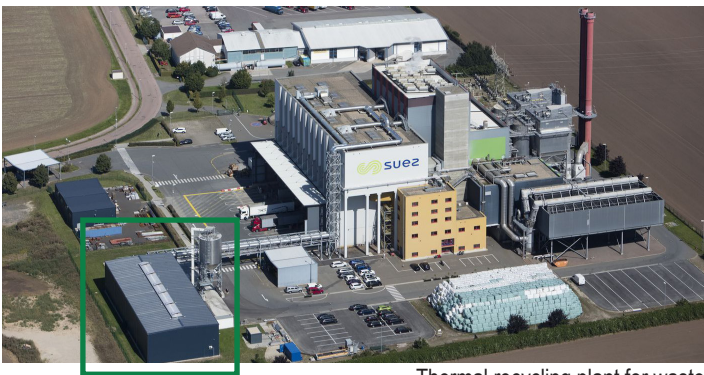
Thermal recycling plant for waste Green box: Exterior view of the dryer building and dry material storage silo