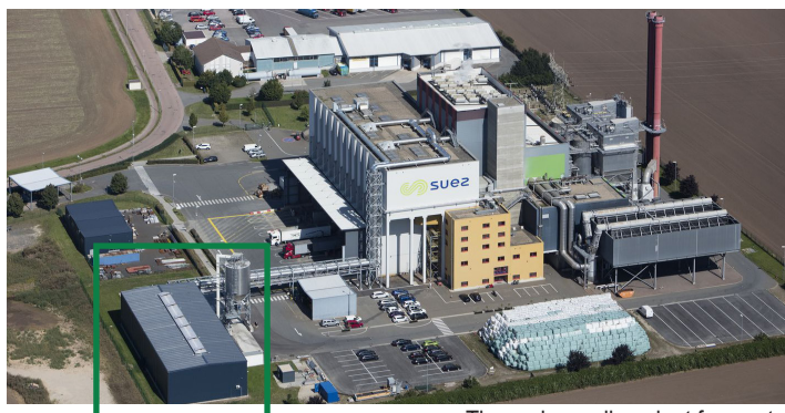
Thermal recycling plant for waste Green box: Exterior view of the dryer building and dry material storage silo