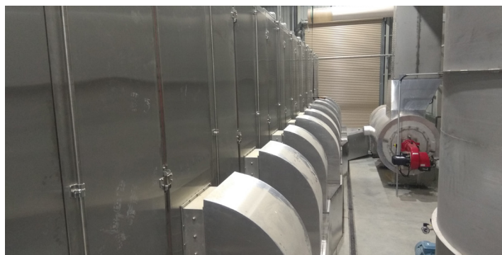
Burner (red) with combustion chamber and subsequent supply air fan for transporting the hot gas into the belt dryer