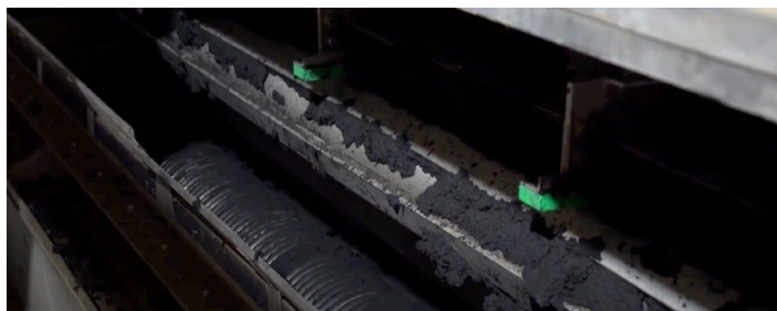
Feed unit with distribution slide and roller press

In 2018 SEVAR installed the first belt dryer in New Zealand, ordered by Hawkins Infrastructure . The Belt Dryer of size BD 3000/11 dries 28,000 t/a of digested, dewatered sewage sludge. The sewage sludge occurs at the Whanganui District Council's municipal wastewater treatment plant. The WWTP is located not far from Lake Tasman and the airport. Whanganui District Council began the construction of the new wastewater treatment plant in 2016. Completion took place in the year 2018. The plant is designed to serve 40,000 residents as well as an industrial load with a 300,000 PE connection size.