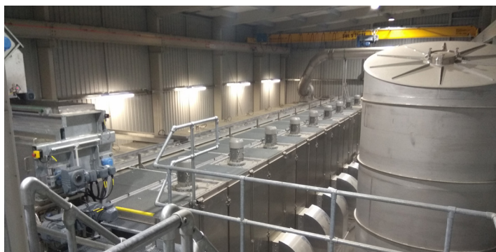
BD 3000/11 belt dryer with distributor/dosing unit and condenser