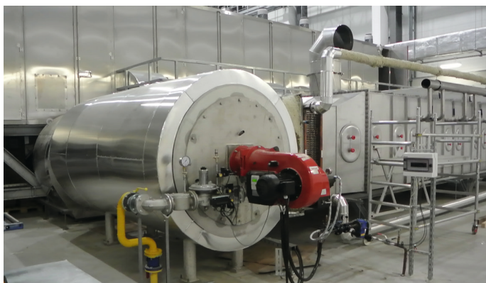
Burner plenum for natural gas with combustion chamber and blower for combustion air