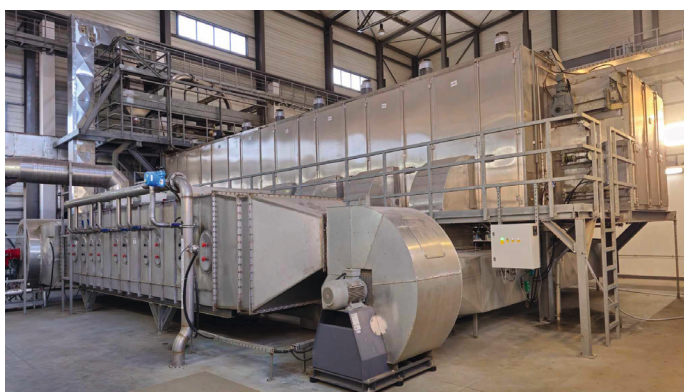
Belt Dryer BD 3000/8 with direct operated horizontal condenser and exhaust air fan