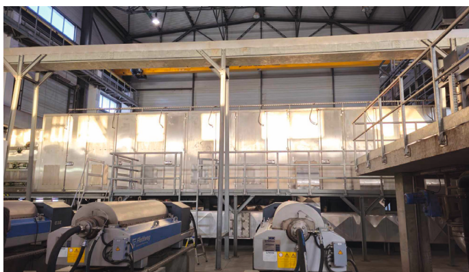
Dewatering centrifuges next to the Belt Dryer

In 2015, the Belt Dryer BD 3000/8 was commissioned for the full drying of undigested municipal sewage sludge generated in the mechanical and biological treatment phase of the wastewater treatment plant in the Polish town of Tomaszów Mazowiecki .