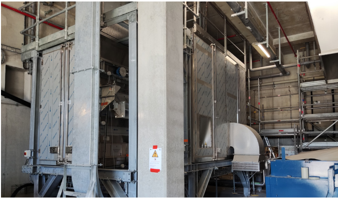
Belt Dryer BD 1500/2 inside building

For the Stel II project, the French company NIJHUIS SAUR INDUSTRIES placed an order with SEVAR AG in March 2022 for a belt dryer of the size BD 1500/2 including delivery, installation supervision and support during commissioning. Due to its compact dimensions with L \times W \times H = 7.8 \times 3.6 \times 4.2 m, the belt dryer was transported completely assembled by a heavy-duty truck from the factory in Karlsdorf-Neuthard to the installation building in Crolles near Grenoble in France. A second truck transported the external auxiliaries such as exhaust fan, feed unit, discharge screw, back-mixing unit consisting of trough chain conveyor, dosing screw, double-shaft mixer.