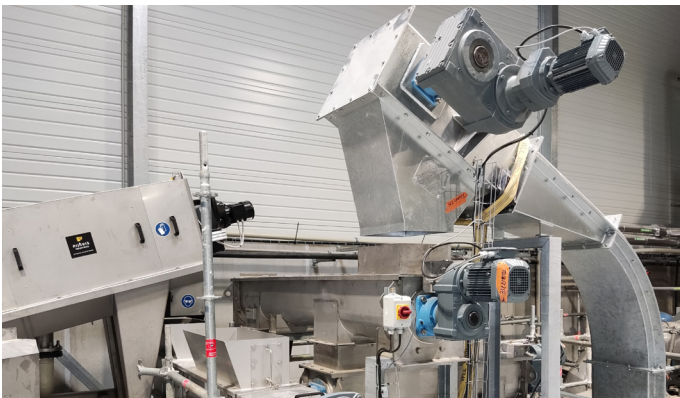
Back-mixing: Trough chain conveyor transports dry sludge into dosing screw

The dried sewage sludge is collected in containers and transported to the cement plant for co-combustion . The humid exhaust air from the dryer is fed to the plant's own exhaust air treatment system, consisting of an acid and a basic scrubber.