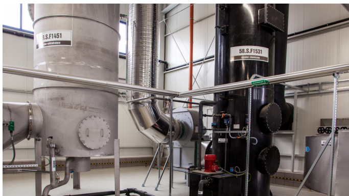
Wet and acid scrubber for exhaust gas