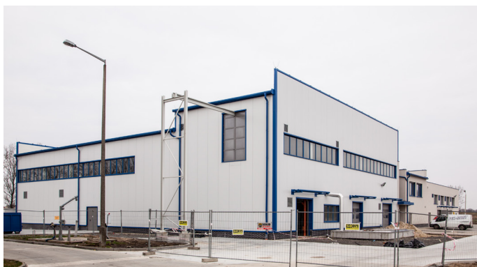
Exterior view building sludge treatment

In 2013, SEVAR AG installed two (2) lines of the Belt Dryer BD 3000/6 with a water evaporation capacity in total of 2,100 kg H 2 O/h in the sludge treatment building of the Opole Municipal Wastewater Treatment Plant, a city in Poland. Independent operation of both lines is possible. The general contractor was the Polish engineering company SEEN Technologie .