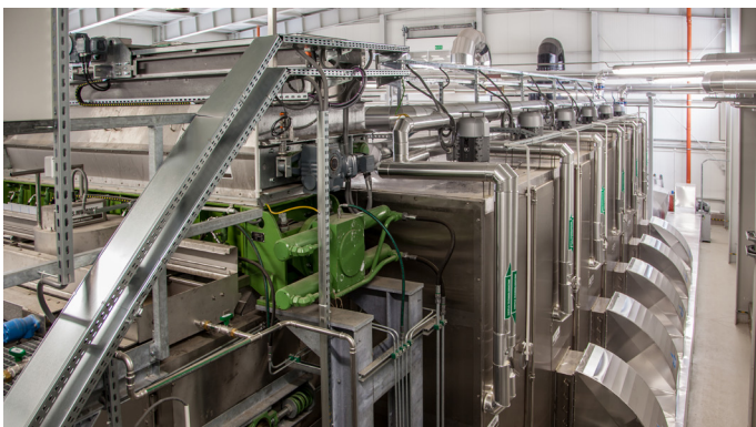
One line of BD 3000/6 belt dryer with feeding unit