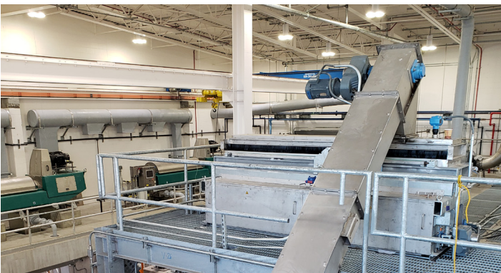
Chain conveyor (wet product) to inlet unit (Distributor-/Dosing-unit) on access platform

In 2015, the well-known construction and civil engineering company Hoffman Constructions Group ordered a complete Biosolids Belt Dryer System from SEVAR AG for the full drying of undigested, dewatered waste activated sludge (WAS) produced during wastewater treatment at the Oak Harbor Wastewater Treatment Plant . Oak Harbor is a city located on Whidbey Island in Washington State on the U.S. West Coast. To protect the environment, for urban development, and to recover resources from wastewater, the City of Oak Harbor started the Clean Water Facility Project in 2010. In 2018, the wastewater treatment plant went into operation. ( www.oakharborcleanwater.org/ )