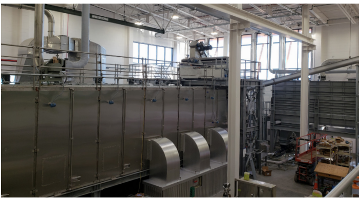
Belt Dryer BD 3000/6 with air duct, inlet unit and wet cake storage hopper

In 2015, the well-known construction and civil engineering company Hoffman Constructions Group ordered a complete Biosolids Belt Dryer System from SEVAR AG for the full drying of undigested, dewatered waste activated sludge (WAS) produced during wastewater treatment at the Oak Harbor Wastewater Treatment Plant . Oak Harbor is a city located on Whidbey Island in Washington State on the U.S. West Coast. To protect the environment, for urban development, and to recover resources from wastewater, the City of Oak Harbor started the Clean Water Facility Project in 2010. In 2018, the wastewater treatment plant went into operation. ( www.oakharborcleanwater.org/ )