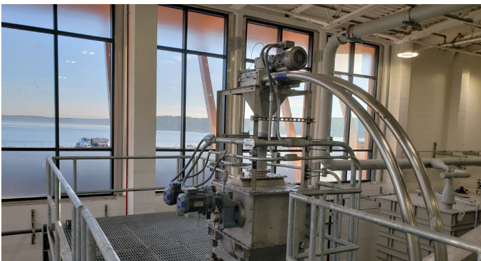
Tubular drag chain conveyor (dry product) to crusher (drum mill)

The scope of supply of SEVAR consisted of one belt dryer with back-mixing and access platform, wet cake storage hopper, pumps, conveyors, hot air generation by burner, direct exhaust air condensation and plant control including PLC and programming, which provides a complete integrated system. Support during installation, commissioning and training of the plant staff as well as the provision of a project engineer are also part of SEVAR's scope.