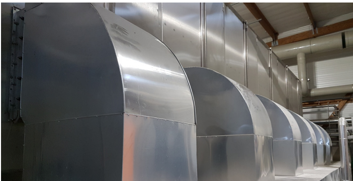
Belt dryer BD 3000/7 with exhaust air ducts