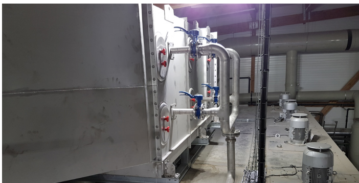
Circulation air fan and condensation

In the department of Morbihan, since 2011, the French town of Locminé and its surrounding area, through the mixed-economy company LIGER (Locminé Innovation Management of Renewable Energies), have built a unique bioenergy center with 10 employees on a 4-ha site in the industrial park.