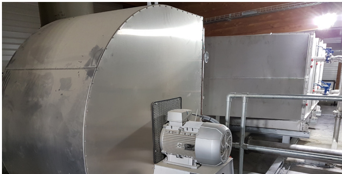
Exhaust air fan