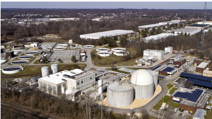
Little Patuxent Water Reclamation Plant (LPWRP)

Howard County operates the Little Patuxent Water Reclamation Plant (LPWRP) in the state of Maryland, USA. As part of the modernization of the treatment plant, the „ Biosolids Belt Drying System “ was installed and has been in operation since January 2021.