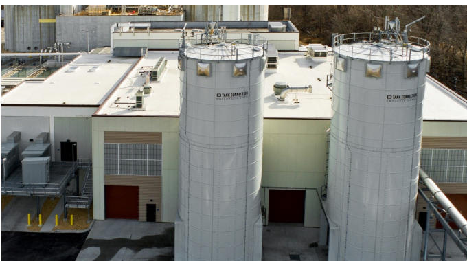
Exterior view of the dryer building with 2x dry material storage silos