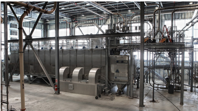
Belt Dryer (Line 2) with back-mixing station

In September 2021 the project „ Little Patuxent Water Reclamation Plant Biosolids Processing Facilities Improvements “ was awarded the Envision Silver Award for Sustainability by the Institute for Sustainable Infrastructure (ISI).