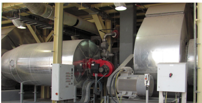
Burner (red) with combustion chamber and supply air fan

SEVAR was contracted in 2009 to install three (3) lines of Belt Dryer BD 3000/12 with 12 drying modules for full drying of 123,500 t/a [247,000,000 lb/h] of digested sewage sludge. The sewage sludge is accumulated at the municipal wastewater treatment plant of Dubai in the Jebel Ali district with a connected size of 1,500,000 PE.