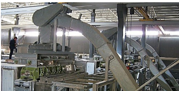
Trough chain conveyor for dewatered sewage sludge to the inlet unit (3x)