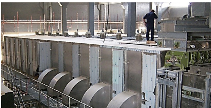
One line of the Belt Dryer BD 3000/12 with dryer inlet unit