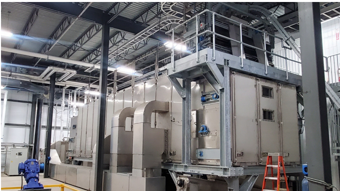
Belt Dryer BD 3000/6 with feeding unit, discharge screw, inlet air duct