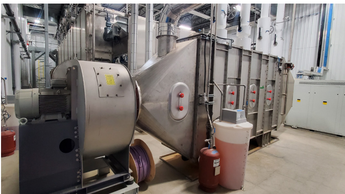
Supply air fan with heat exchanger and horizontal condenser