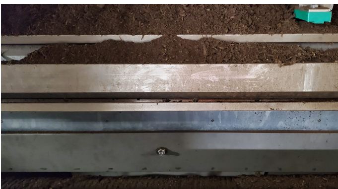
Pre-dried material above roller press for transfer to upper dryer belt

CTBM - Centre de Traitement de la Biomasse de la Montérégie is an organic waste management center for the treatment of liquid and semi-liquid residues from the agricultural and food industries in Canada. The center is equipped with three digesters and a secondary digester for biomethanization of the biogenic residues to produce biogas. A part of biogas is used as energy for the center, while the other part is injected into the public utility grid.