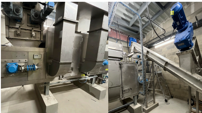
Left: Pilot dryer with feed unit and exhaust air ducts Right: Material feed via screw conveyor

Cométha is a joint innovation partnership project between SIAAP (French wastewater association) and Syctom (public operator for household waste recycling) in the Paris region, France. The companies treat the wastewater of 9 million inhabitants and treat the household waste of 6 million inhabitants. For Syctom's goal of turning waste into a resource with a sustainable circular economy , recycling routes are constantly being optimized. The Belgian engineering group John Cockerill has overall responsibility for the project as EPC contractor with the participation of SEVAR AG as subcontractor for drying.