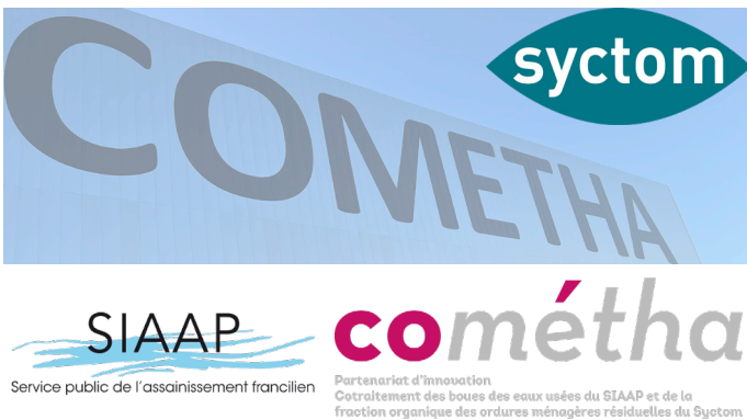
Logo project Cométha, project partners SIAAP and Syctom