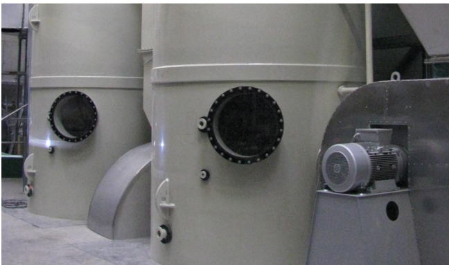
Chemical scrubbers (acidic & caustic)

The sewage sludge, dried to 90 % dry residue and crushed to 1 - 4 mm in a roller mill, is stored in a 150 m 3 silo and utilized as a fuel substitute (calorific value similar to lignite) in a regional cement factory.