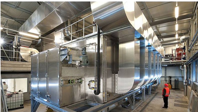
Belt Dryer BD 3000/6 with material return module and exhaust air ducts

The city of Albstadt in Baden-Württemberg ensures a permanent, environmentally friendly and cost-effective sewage sludge disposal for the municipal sewage treatment plant as well as for the sewage treatment plants in the regional surroundings. For this purpose, a biomass cogeneration plant with sewage sludge drying has been realized at the Albstadt-Ebingen wastewater treatment plant.